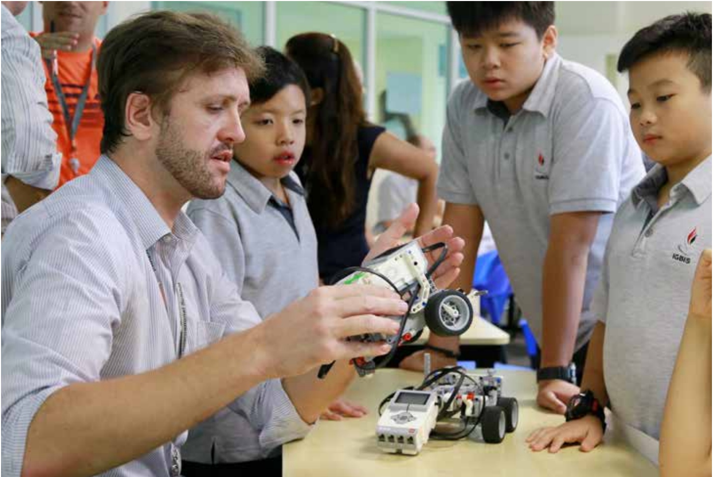
IGBIS Inaugural Activities Fair