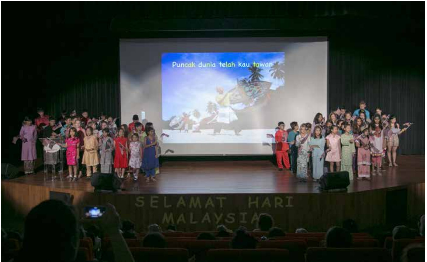
Malaysia Day Assembly