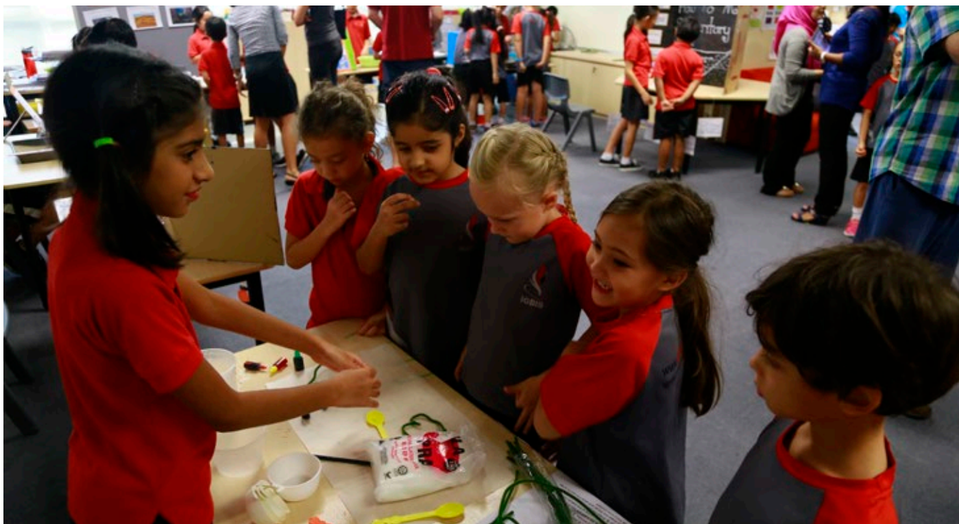
● Grade 4 Science Fair - 23rd March 2016.