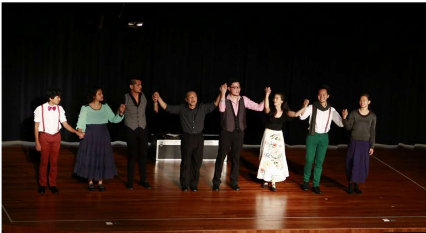
● 'The Merchant of Venice' - A theatre play by KL Shakespeare Players @ IGBIS Theatre, April 1 st 2016