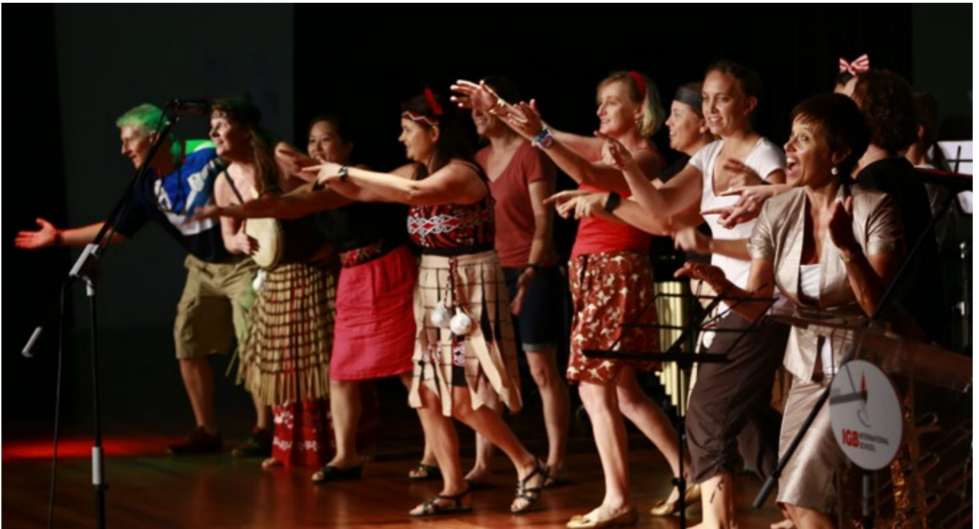
• Teachers performance during The International Day @ IGBIS Theatre, April 9 th 2016