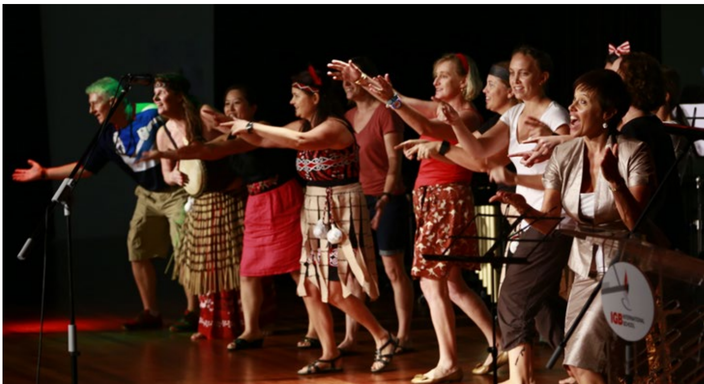
• Teachers performance during The International Day @ IGBIS Theatre, April 9 th 2016