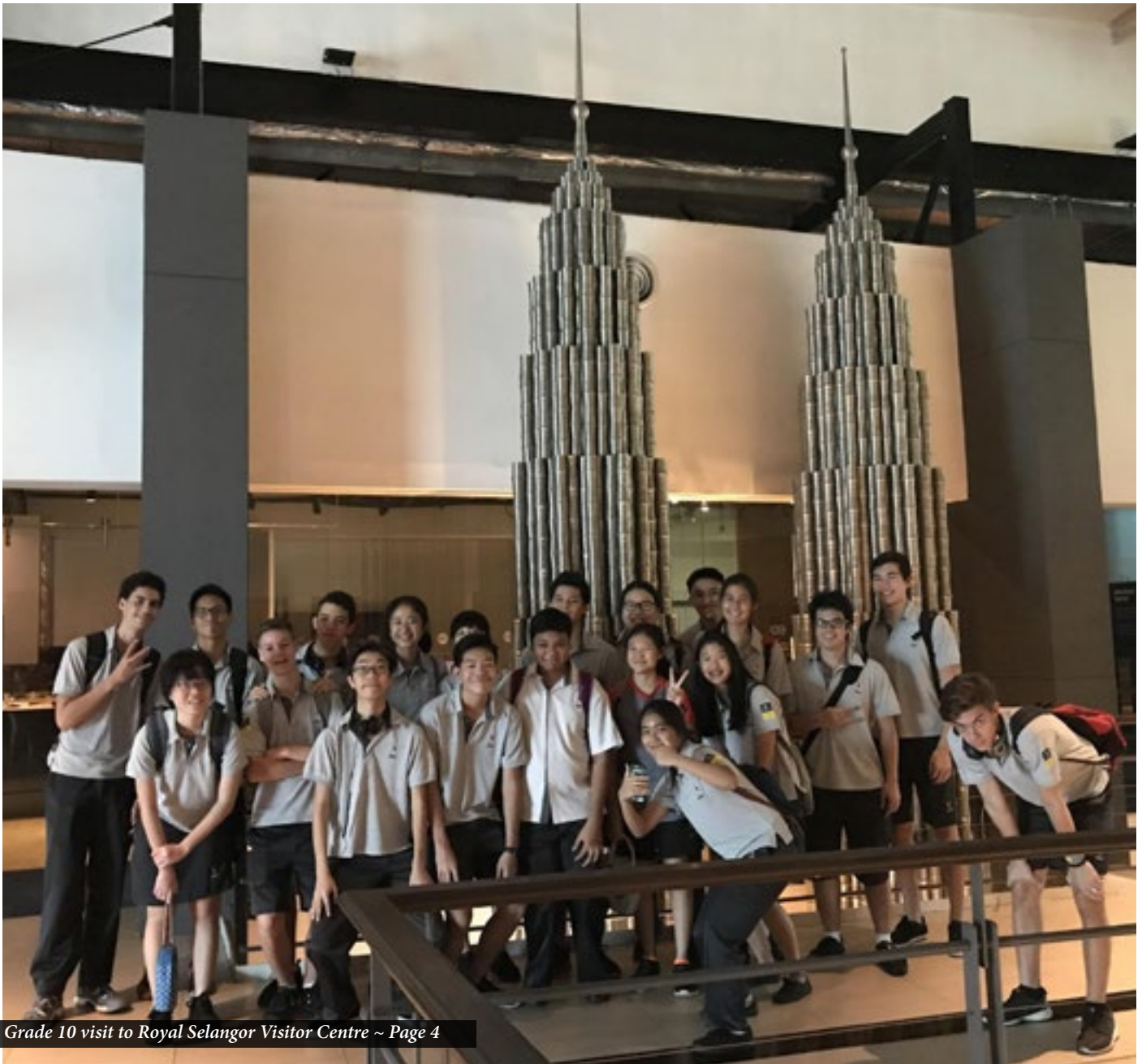
Grade 10 visit to Royal Selangor Visitor Centre ~ Page 4