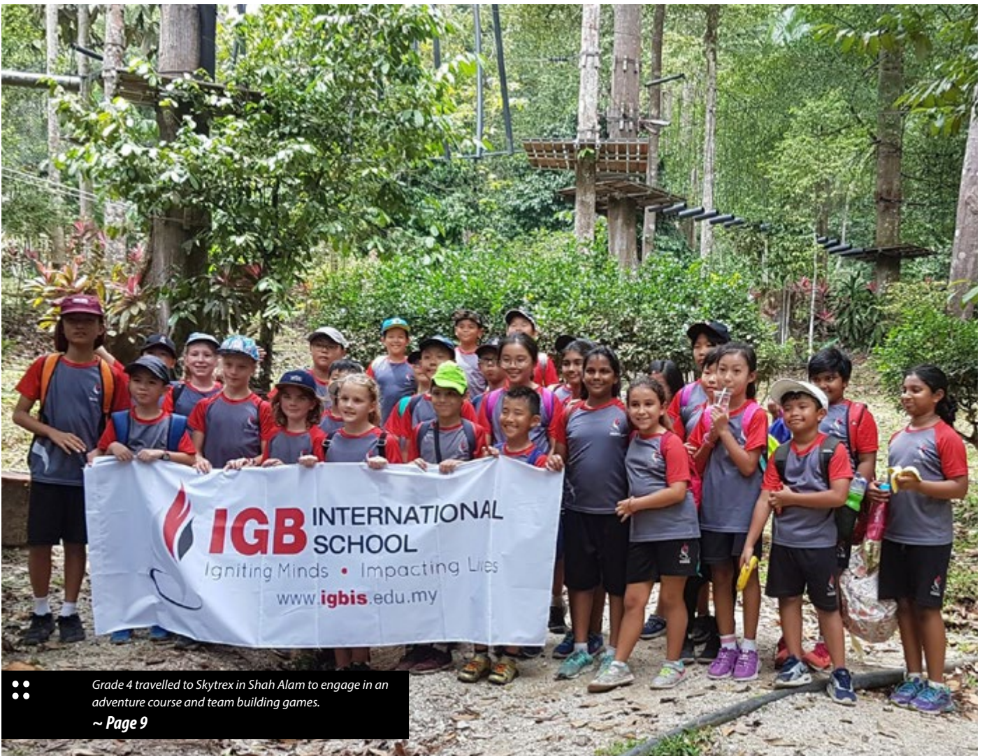
Grade 4 travelled to Skytrex in Shah Alam to engage in an adventure course and team building games. ~ Page 9