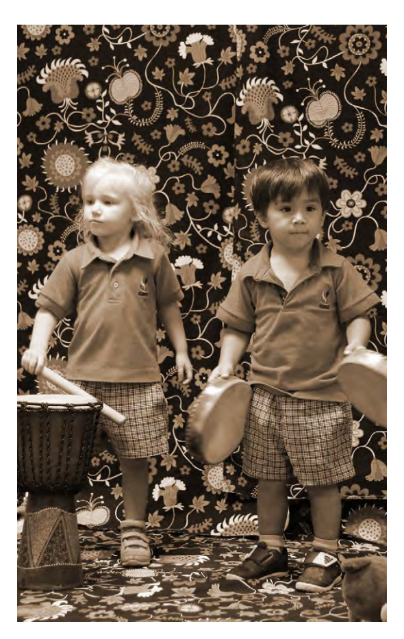
Teaching & Learning at IGBIS for 2 - 6 years old

Together with children and adults, the learning environment is an essential component of teaching and learning at IGBIS. The learning environment is not only the classrooms and outdoor spaces, but everything that surrounds the children, such as: conversations; relationships; the use of light, colour and material; and the documentation that creates a constant reflection on the community of learners. At IGBIS, educators plan carefully for environments that are aesthetic, thought-provoking and instil a sense of natural curiosity and wonder. We take time to evaluate our choices for indoor and outdoor areas and we are in constant dialogue with our learners and teachers across school and curriculum areas to make sure that choices we make and environments we develop attract and provoke rich learning for children with a wide variety of needs.